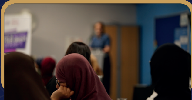
WELFARE & WELLBEING