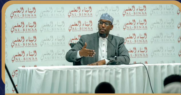
DAWAH & OUTREACH